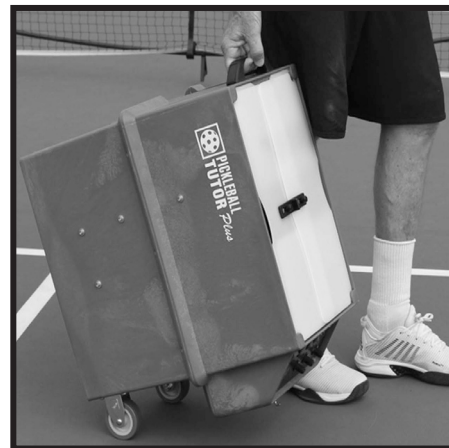
Transporting the Pickleball Tutor Plus

If ball throws become less consistent, clean the ball throwing wheels to remove any build-up that can result from the “slick film” common on the surface of brand new pickleballs. Periodic cleaning of the wheels will maintain consistent throws. Some of the coloration from balls can transfer to the wheels but this is normal and will not affect the ball throws.