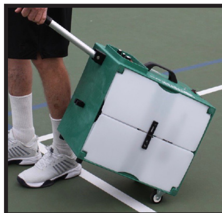
Pickleball Tutor Spin with towing handle

To transport the Pickleball Tutor Spin , set machine on the towing wheels and swing out the towing handle. Pull the machine behind you as illustrated. You can also carry the Pickleball Spin with the carry handle if you have steps or stairs.